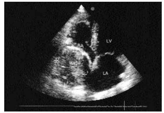
Fig. 1. Transthoracic apical four chamber view showing a giant right atrial myxoma almost totally occupying right atrium. RA: Right atrium; MASS: Myxoma filling the right atrium; LV: Left ventricle; LA: Left atrium.