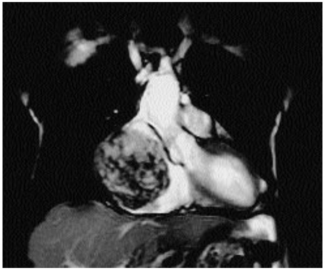
Fig. 2. Magnetic resonance image demonstrating myxoma in the right atrium.