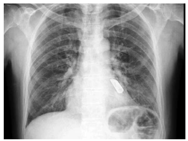
Fig. 2. Chest roentgenography showed the foreign body.

and obstructive pneumonia. It has also been reported that a foreign body located in the pleural cavity may cause chronic empyema and malignancy.<sup>[3]</sup>