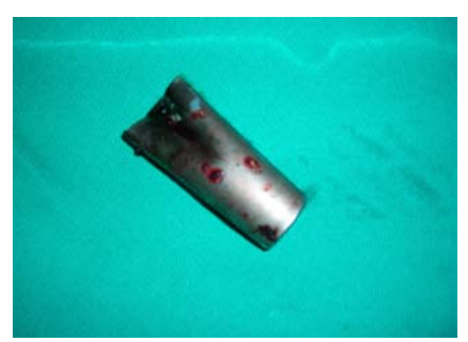
Fig. 4. Exploded lithium battery.

Our case, though rare, pointed out the possibility of the development of a life-threatening PTT due to the explosion of a battery.