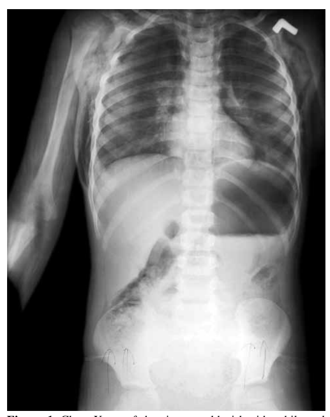
Figure 1. Chest X-ray of the six-year old girl with a bilateral pneumothorax and subcutaneous emphysema on admission to hospital after the injury.

A left explorative thoracotomy was performed on the 16th day post-injury. An endotracheal tube was inserted into the right main bronchus under bronchoscopy guidance, and the left chest was entered via a standard posterolateral incision into the fourth intercostal space. The left lung was airless and small. The left main bronchus was completely divided with the distal and proximal ends covered by fibrous tissue (granulations) and occluded, and there was a 2.5-3 cm gap between the bronchial ends. The distal end of the left main bronchus was opened and a large quantity of gelatinous, clear mucus was aspirated from the bronchial lumen. Both bronchial ends were debrided, and bronchial continuity was re-established using absorbable interrupted sutures (Vicryl 4.0) between the distal and proximal ends of the transected left main bronchus. The endotracheal tube was repositioned into the trachea, and the left lung was inflated and fully expanded without any apparent air leak along the suture line. The chest was drained with one intercostal chest tube, and the wound closed. The patient was extubated 24 hours after surgery.