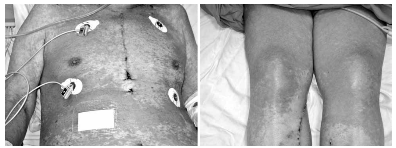
Figure 1. Erythematous eruption spreads on 30% of body surface area.

and a new onset skin rash. Macular erythematous eruptions on his trunk which had spread to his neck, arms, and legs (Figure 1) were seen on physical examination. Eruptions and bullous lesions were also noticed in the buccal and pharyngeal mucous membrane (Figure 2). He had a fever (39.1 °C) and was slightly agitated.