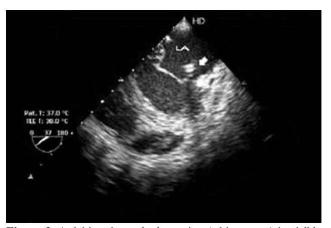
Figure 2. A dehisced annuloplasty ring (white arrow) is visible on the transesophageal echocardiogram. LA: Left atrium.