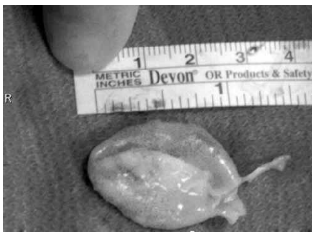
Figure 3. Removed cystic material.