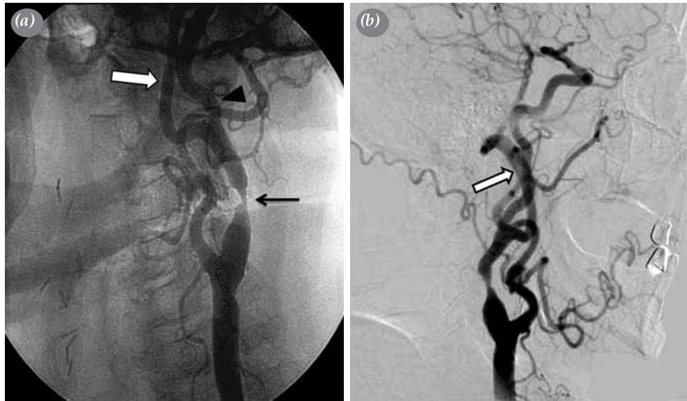
Figure 1. (a) Live image of preoperative left carotid angiography. Cerebral angiography showed severe left ICA stenosis (black arrow) and divergence of the persistent primitive hypoglossal artery immediately distal to the stenosis (arrowhead). The white arrow shows the distal internal carotid artery after the divergence. (b) Lateral view of intra-arterial digital subtraction angiography showing the persistent primitive hypoglossal artery (arrow) connecting the left internal carotid artery with the basilar artery.

A carotid artery stenting (CAS) procedure was performed under local anesthesia without embolic protection devices. A guiding catheter (8F) was placed in the left common carotid artery (LCCA). Over an exchange guidewire, a Precise® self-expanding stent (Cordis Corporation, Hialeah, Florida, USA) measuring 8.0x40 mm was successfully deployed in the stenotic segment of the left cervical ICA. Postdilatation was performed due to residual stenosis using an Aviator™ Plus 6.0x20 mm diameter balloon (Cordis Corporation, Hialeah, Florida, USA). An angiographic examination immediately after the CAS showed good apposition of the stent to the arterial wall with restoration of the luminal diameter (Figure 3). The patient's postoperative clinical course was good, and postoperative magnetic resonance imaging (MRI) showed no ischemic complications. Five days after surgery, the patient was discharged with no neurological