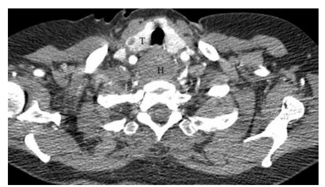
Figure 2. Postoperative control computed tomography angiography demonstrating that the reduced hematoma. The aneurysm is no longer visible. T: Thyroid; H: Hematoma.

The first report of an ITA aneurysm and rupture was in 1959.<sup>[4]</sup> Of the 29 cases that have been reported since then, nine patients (32.2%) presented with spontaneous rupture, and three (9.6%) of these died as a consequence.<sup>[5]</sup> Our patient is the 30<sup>th</sup> overall reported case and the 10<sup>th</sup> that presented with spontaneous rupture.