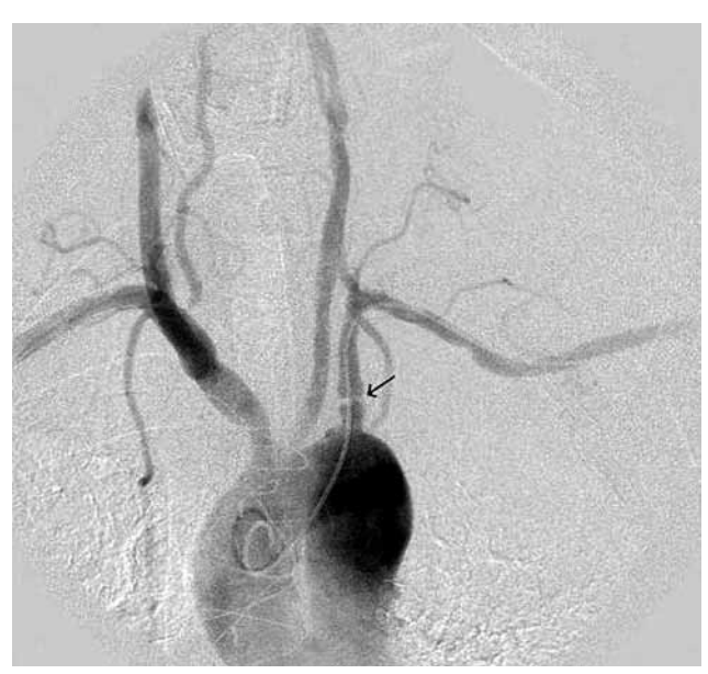
Figure 1. Angiography revealed a critical stenosis in the proximal part of the left subclavian artery.

Diagnostic modalities that have been used to detect subclavian arterial disease prior to the placement