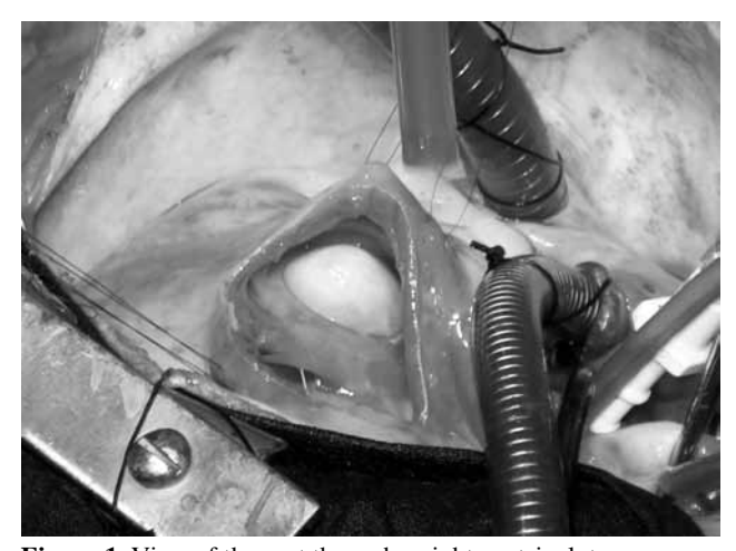
Figure 1. View of the cyst through a right ventriculotomy.

was on sinus rhythm, and no blocks were observed. Albendazole treatment was given to decrease the risk of relapse. The patient was discharged on the postoperative eighth day without complications, but the albendazole treatment was continued for one month.