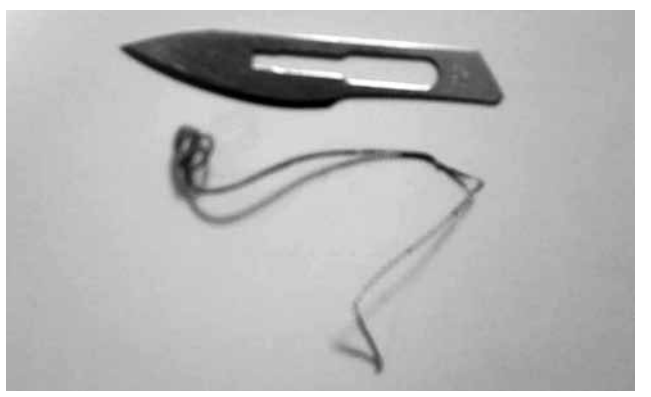
Figure 2. Postoperative picture of the removed coil.