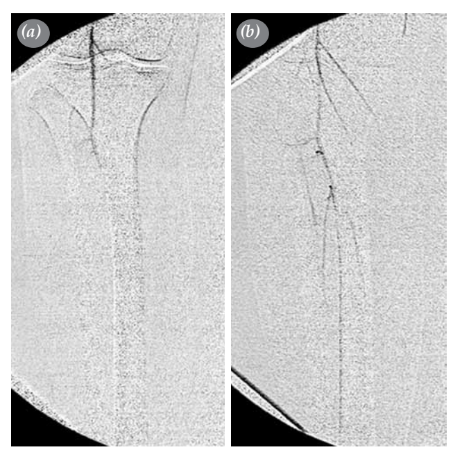
Figure 2. Two views of the right infrapopliteal arteries are shown after the contrast injection from the 4F introducer was placed in the right common femoral artery. (a) There is no visible filling of the infrapopliteal arteries before papaverine injection. (b) The infrapopliteal arteries can faintly be seen after the papaverine injection.

circulatory status of the extremities. On her physical examination performed two months later, there were normal to weak femoral and popliteal pulses along with diminished distal posterior tibial and dorsalis pedis artery pulses. Although the patient stated that she had significant improvement in her ability to walk, she still complained of intermittent claudication. Therefore, she was included on the transplantation recipient list for renal, liver, and cardiac transplantation. Computed tomography (CT)