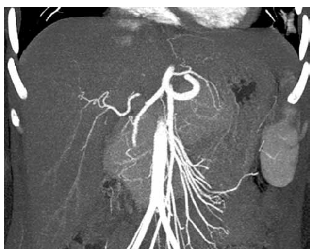
Figure 3. Computed tomography angiography two months later reveals the increase in diameter of the abdominal aorta and iliac artery.

angiography obtained for preoperative evaluation for transplantation revealed increased abdominal aorta (15 mm) and external iliac artery (9.5 mm) diameters (Figure 3). Furthermore, her Doppler ultrasound examination revealed patent lower extremity arteries with monophasic flow patterns in the infrapopliteal arteries.