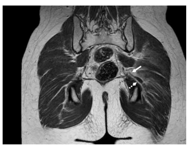
Figure 2. Coronal T<sub>2</sub> weighted hip magnetic resonance imaging showing an increase in diameter (dashed arrow) and hypointensity in the inferior gluteal vein compatible with thrombosis (arrow).

Using pelvic MR venography as a diagnosis test, Rodger et al.<sup>[1]</sup> reported a surprisingly high rate of pelvic DVT (46% overall) in asymptomatic women after a cesarean section. Deep venous thrombosis occurred predominantly in the iliac veins with the exception of one case located in the common femoral vein.<sup>[1]</sup> Thrombosis of the pelvic veins, including the internal iliac veins, has also been reported after orthopedic surgery in men and in conjunction with pelvic inflammatory disease in women. In addition, it has been identified with the involvement of the prostatic plexus and septic pelvic vein thrombophlebitis in both genders.<sup>[2]</sup>