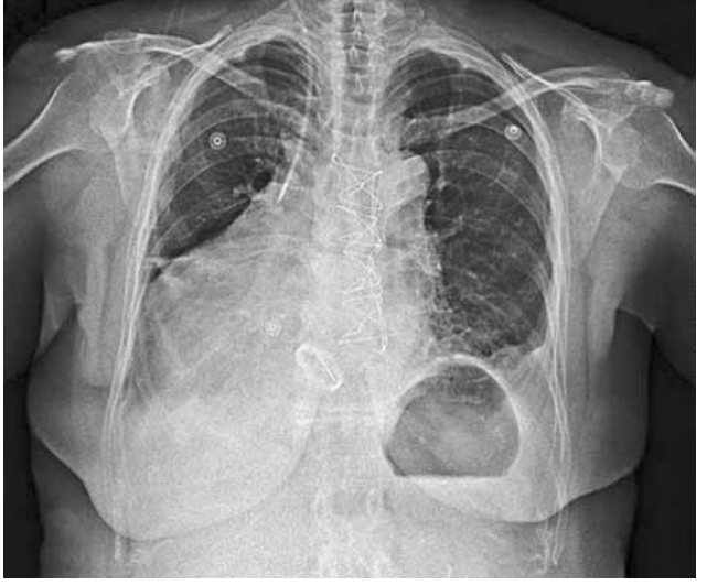
Figure 2. Postoperative day four chest X-ray.