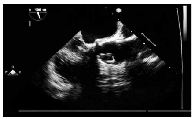
Figure 1. Transesophageal echocardiography showing the small pannus beneath the sewing ring (arrow).

with an oscillating saw as well. Once the chest was opened, the adhesions were released, and the conduit was opened vertically. Next, the prosthetic valve was inspected, and the valve leaflet appeared to be opening and closing well. However, there was a pannus below the sewing ring that was possibly obstructing the closure of the leaflet (Figure 3a, b). It was excised, and the area near the left main ostium was then free from the pannus or thrombus. A clean saline wash was applied, and the aortotomy was closed using 4-0 polypropylene. The patient was then rewarmed and weaned off of the cardiopulmonary bypass (CPB) with stable hemodynamics. Postoperative echocardiography showed a normally functioning aortic valve, an aortic valve gradient (AVG) of 7/4 mmHg, good biventricular function, and no pericardial effusion or pannus. Her postoperative course was uneventful, and the patient was discharged after 12 days. At her three-month follow-up, the patient was asymptomatic and a TTE revealed a normally functioning aortic prosthesis.