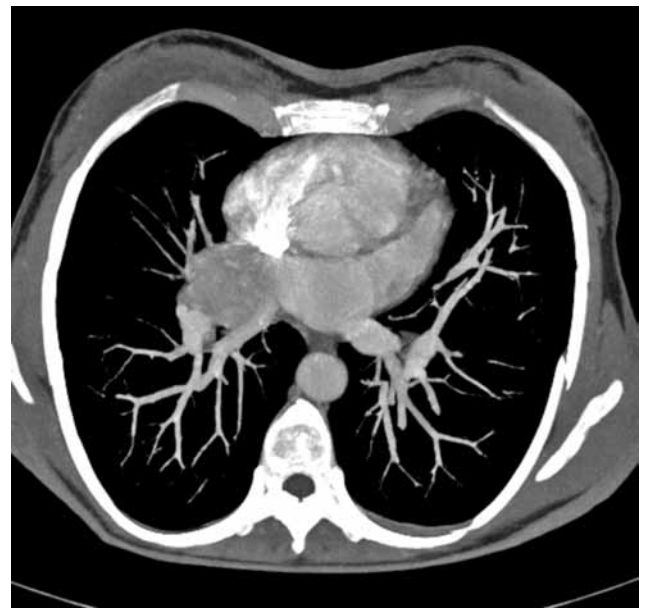
Figure 1. A single slice of contrast-enhanced computed tomography at the level of the mass.

A 37-year-old woman presented with dyspnea, a cough, and chest pain that had been ongoing for two months, but she had no other symptoms such as palpitation, sweating, or headaches. Her past medical history was insignificant. A physical examination and routine biochemical tests were normal. However, a chest X-ray revealed a homogenous opacity on the right hilar area, and chest computed tomography (CT) revealed a mass measuring 51x41x35 cm in diameter that extended from the right pulmonary artery to the mediastinum. The tumor was compressing the right middle lobe bronchi via the splaying of the superior pulmonary vein branches (Figure 1). The patient underwent a nondiagnostic fiberoptic bronchoscopy that detected only the compression of the middle lobe bronchus, and a nondiagnostic transbronchial needle aspiration (TBNA) biopsy was also performed. The patient then underwent a CT-guided transthoracic fine needle aspiration biopsy (FNAB) to make a histopathological diagnosis, and it showed monomorphic epithelial cells but was also nondiagnostic. Because of the nondiagnostic transthoracic FNAB, a right posterolateral thoracotomy was performed through the fifth intercostal space along with a partial excision of the hypervascular tumor that extended to the mediastinum. There was excessive