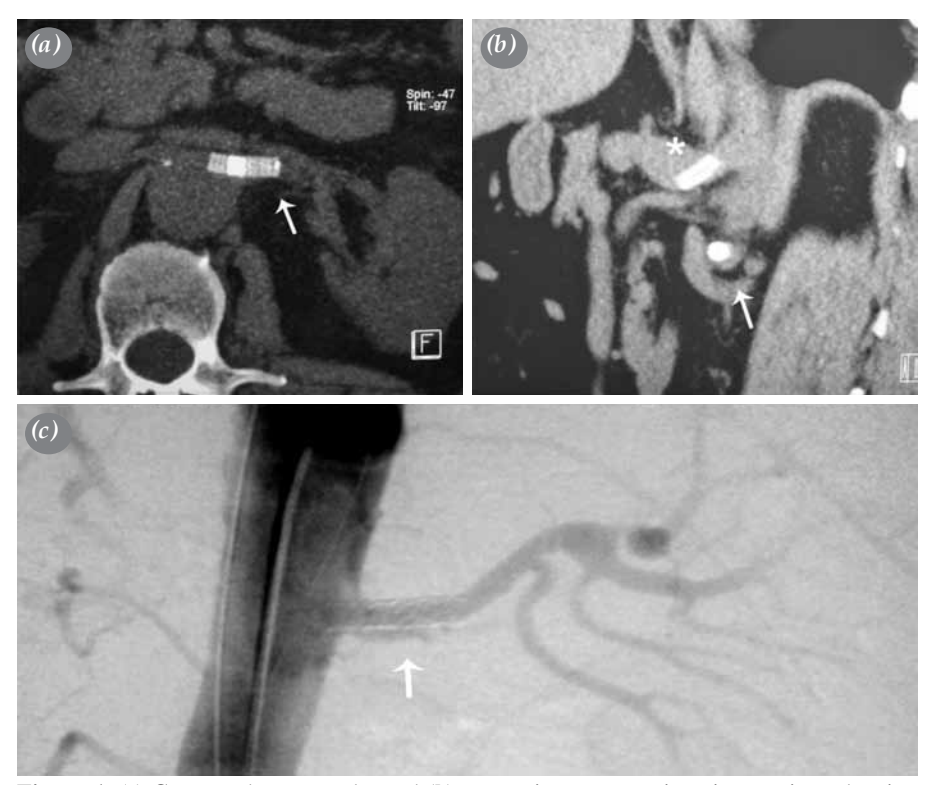
Figure 1. (a) Computed tomography and (b) magnetic resonance imaging sections showing the stented left renal artery (white arrow), and the celiac trunk stent (asterisk). Note that the renal artery was revascularized with two stents (stent-in-stent) due to the incomplete coverage of the dynamic obstruction with the first stent. (c) Digital subtraction angiography image showing the partial filling of the false lumen in the left renal artery during the procedure. Note that only the left renal artery was visible at this stage of the procedure.

We also found one patient with Marfan syndrome who presented with acute left leg ischemia and back