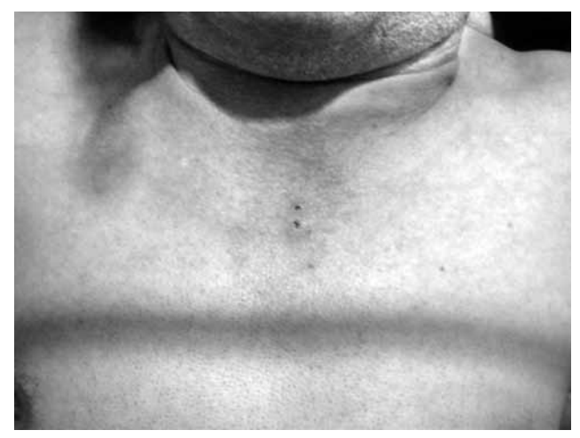
Figure 1. Staple gun entrance.

Hence, the endovascular treatment option was not preferable, and the patient underwent immediate surgery knowing that cardiopulmonary bypass (CPB) might be needed. A figure-L unilateral mini-sternotomy was then performed on the right side by transecting the third intercostal space with a skin incision measuring approximately 8 cm. After the accurate dissection of the thymus and hematoma, the aorta and innominate artery were visualized. The pericardium was also opened to explore whether there was any hemorrhage, but we only aspirated the serous fluid. The pseudoaneurysm and entrance holes were found after tracing the ascending aorta to the innominate artery, and CTA located the pseudoaneurysm on the ostium of the innominate artery origin (Figure 3). In addition, a second hole was detected between the innominate artery and the left