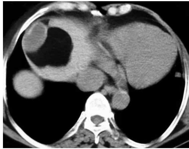
Figure 1. Computed tomographic image of the first case showing the homogeneous, smooth-bordered cystic lesion at the lateral portion of the diaphragm. Separation from the liver border at the localization was achieved correspondent to the anterior basal segment of the lower right lung.

The thorax was entered through the seventh intercostal space via a right posterolateral thoracotomy, and the muscle fibers of the diaphragm were split, revealing three hydatid cysts. One measured 4x5 cm in diameter and two others measured 1 cm.