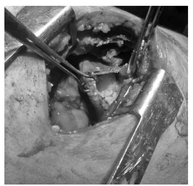
Figure 4. Operative view of the third case showing the diaphragmatic rupture of the hydatid cyst.

showed exophytic elongation. Moreover, no distinction could be made between the posterior border and the liver in this patient (Figure 2).