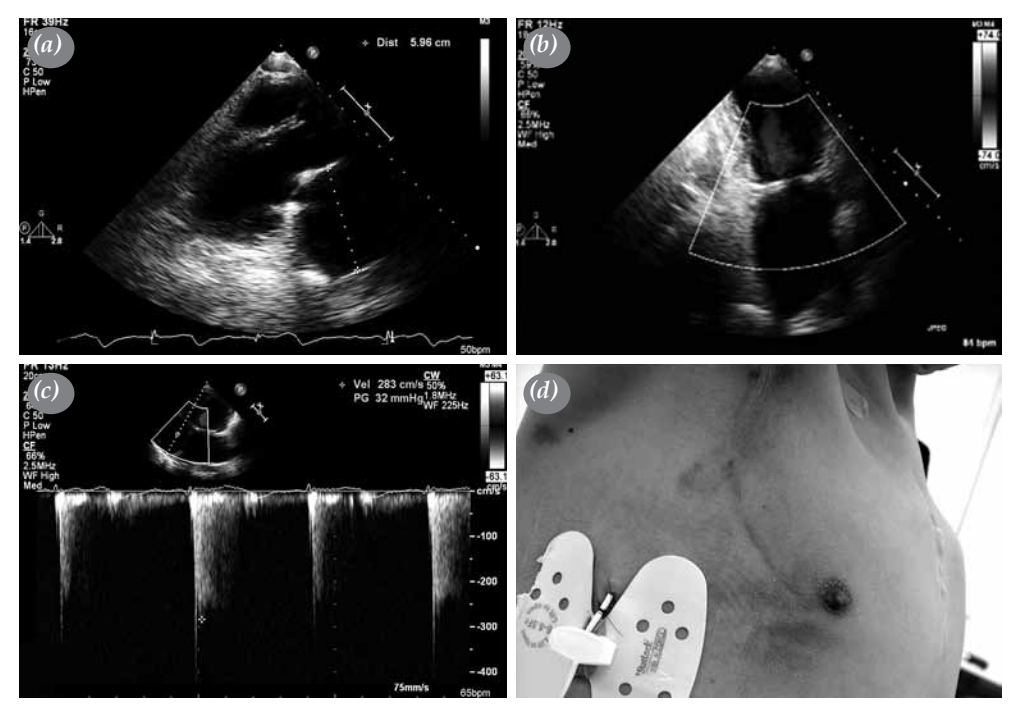
Figure 4. (a) Postoperative echocardiogram showing the decreased diameter of the left atrium, (b) the competent mitral valve, (c) improved pulmonary hypertension, and (d) the postoperative surgical wound.

small and there was a mild adhesion in the right pleural cavity, all of the procedures were done under direct visualization without thoracoscopic assistance. The right internal jugular vein was cannulated percutaneously, and the right femoral artery and vein were cannulated via a 2 cm skin incision. Intrapericardial dissection around the right atrium was feasible without cardiopulmonary bypass (CPB), but bypass was initiated to facilitate the dissection