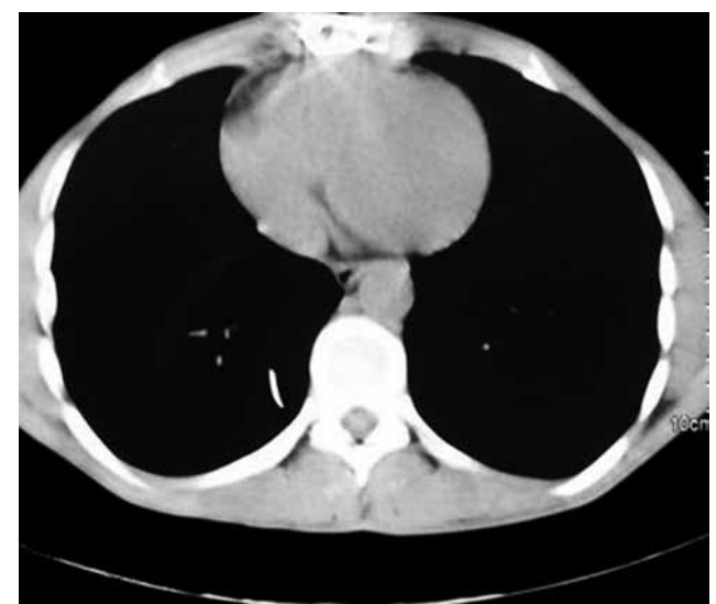
Figure 1. Computed tomography revealing a foreign body in the right posterior basal segment of the lung.

uneventful, and he was discharged fours days after the second operation without any complications.