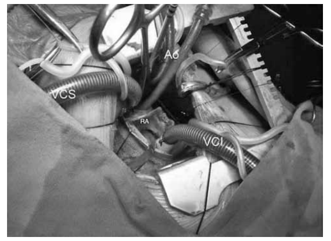
Figure 1. View of the surgical field during the thoracic procedure.

Table 2 summarizes the score range and direction of the tools to assess the scar and evaluate the patient's satisfaction with the cosmetic results. At the postoperative sixth month, age-based questionnaires, which were filled out by the patients themselves or their parents under the supervision of a psychologist,