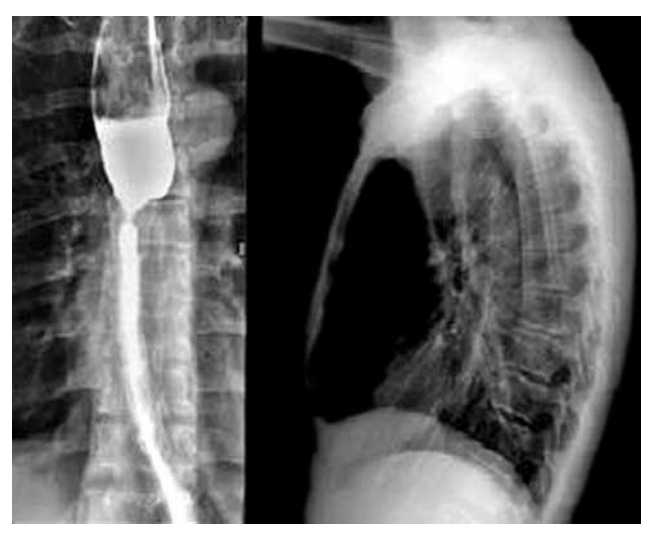
Figure 2. Radiographic view of two of the self-expandable metal stent.

were placed in one patient because of restenosis related to tumor overgrowth that appeared several months after previous stent placements, and two SEMS were placed in eight patients for the same reason (Figure 2). A single self-expandable stent was placed in the remaining patients. The stent diameters ranged from 16 to 20 mm, and the length of the stents varied between 6 and 15 cm. Before the stents were implanted, endoscopic balloon dilatation was performed on all of the patients (100%), and a Dumon stent (Novatech SA in France) was inserted in the trachea of one patient with esophageal and