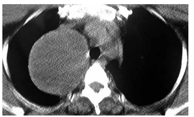
Figure 2. Chest computed tomography showing the giant hydatid cyst.