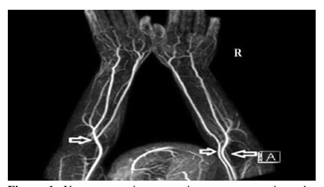
Figure 1. Upper extremity magnetic resonance angiography image showing the right brachial artery duplication with radial and ulnar arteries.

A 38-year-old female patient was admitted to our clinic with complaints of numbness and pain in her hands when she folded her left upper arm for past