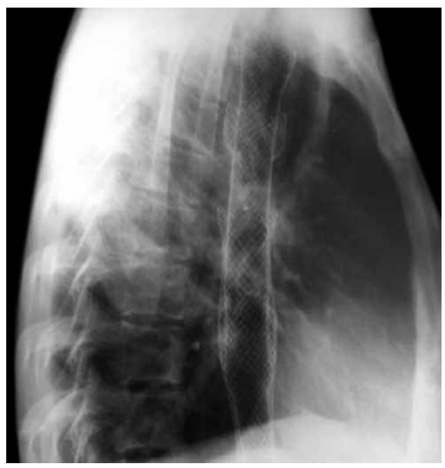
Figure 2. A case of three stenting.

closed using a second esophageal stent. One of these patients died after 15 days due to empyema.