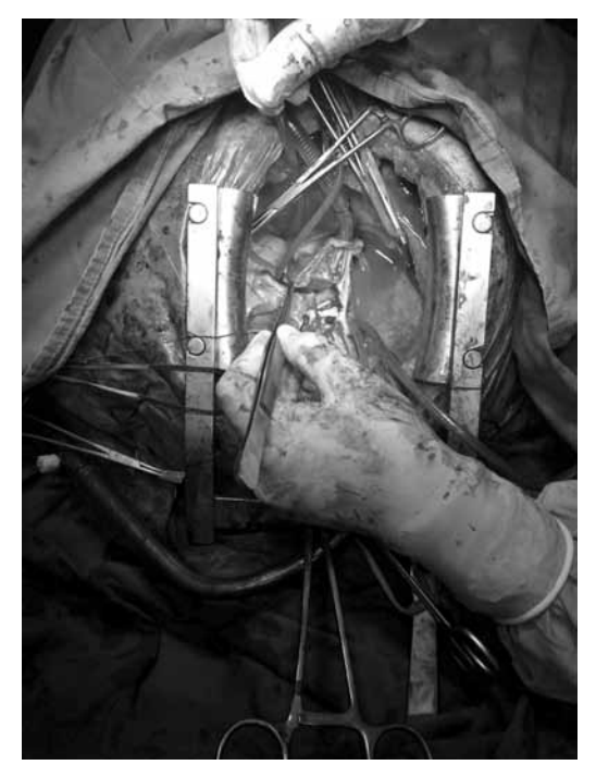
Figure 1. An intraoperative image of the right atrial tissue anastomosis.

prosthesis 10 months ago. Echocardiography revealed normal prosthetic valve functions; however, the ejection fraction (EF) of the left ventricle was 15% and the patient was on inotropic agents. The patient was on the emergency call, as the donor heart was presented. The organ donor was 43-year-old female with a BMI of 24.2 kg/m<sup>2</sup> with a body surface area of 1.66 m<sup>2</sup>. Harvesting donor heart was accomplished according to the standard procedures and the organ was stored and transported with a helicopter. Cold ischemia time (the time between cross-clamping of the donor heart and de-clamping after transplantation and re-warming) was four hours and 44 minutes. Meanwhile, arterial cannulation was chosen as the femoral region, as the patient was scheduled for a third sternotomy operation. The adhesions were removed and the vena cava superior (VCS) and VCI were prepared for venous cannulation. Both VCS and VCI were transected, after cross-clamping, by securing a certain length to perform the anastomosis safely. The recipient's cross-clamping time was 164 min. The anastomosis was performed in the following order: left atrium, VCS, pulmonary artery, aorta, and VCI. However, there was a gap between the VCI of the donor heart and the VCI of the recipient. Therefore, to avoid an unsafe and highly distended anastomosis, we prepared a tubular patch homograft using the recipient's right atrial tissue in a size of