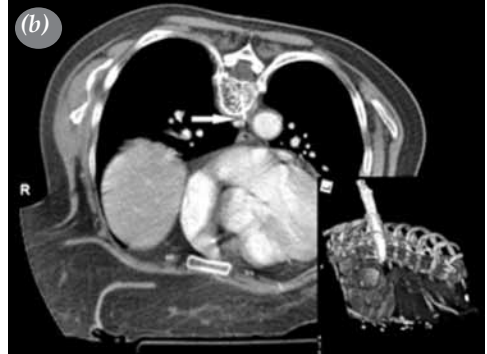
Figure 1. Contrast enhanced computed tomography of chest with three-dimensional multiplanar reconstruction views demonstrate (a) route of blade through medulla spinalis and vertebral body and (b) tip of blade towards thoracic region (indicated by white arrow).

respect of any need for decompression and duraplasty. After the spinal cord penetration zone of the knife was clearly exposed, dural laceration and cerebrospinal fluid leakage were observed. The knife was removed gently under thoracoscopy guidance, and the dural laceration was repaired. No additional laceration or bleeding was determined during the exploration of the right hemithorax. After confirmation of the clinical and hemodynamic stability, thoracoscopy was ended with tube thoracostomy. The patient was followed up in the intensive care unit for one week. The chest tube was removed on the postoperative fifth day. The patient was discharged on the postoperative eighth day with no neurological deficits.