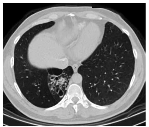
Figure 1. Computed tomography images of benign lesions (left lower lobe bronchiectasis).

patient characteristics such as additional diseases or tuberculosis history, stage for malignant diseases, surgical characteristics such as port properties and amount of bleeding, postoperative characteristics such