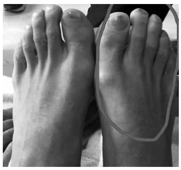
Figure 4. The foot is clinically slightly ischemic and numb, and the color is white.

Two days after CTA, the patient underwent a conventional angiography with the aim of a possible recanalization with pulse thrombolysis and/or an