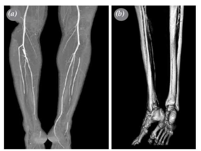
Figure 3. (a, b) Computed tomography angiography showing an occlusion of the right posterior tibial artery in length of 4.5 cm in malleolus level with a refilling over the side branches from the plantar artery.

Anticoagulation treatment was administered with low-molecular-weight heparin combined with calcium channel blockers with suspect of traumatic arterial spasm. Three days later, the peak systolic velocity increased on Duplex scan; however, it did not show the normal pattern again. The patient discontinued medications by himself due to headache on the third day. One week after the first Duplex scan, a computed tomography angiography (CTA) was ordered; however, the patient preferred waiting for his personal doctor (specialist for sport medicine) who was expected to come from another country. Finally on Day 14 of the first Duplex scan, CTA showed an occlusion of the right PTA in the length of 4.5 cm in malleolus level