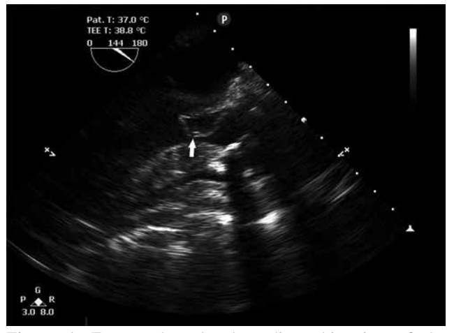
Figure 1. Transesophageal echocardiographic view of the accessory mitral valve.