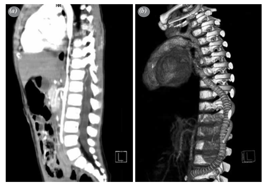
Figure 1. Computed tomography images. (a) Contrast-enhanced computed tomography of a three-year-old boy with congenital middle aortic syndrome. (b) Three-dimensional computed tomography scan of an 8 mm polytetrafluoroethylene graft 10 years after thoracoabdominal bypass grafting.

In laboratory, he had normal hepatic (aspartate aminotransferase: 38 U/L, alanine aminotransferase: 22 U/L) and renal (creatinine: 0.54 mg/dL) function. In three-dimensional reconstruction of the CeCT, the descending and the infa-renal abdominal aortic