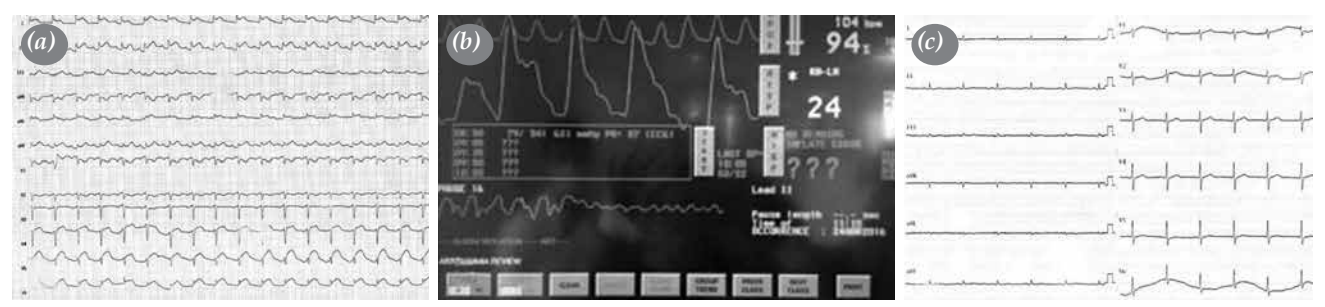
Figure 1. (a) Electrocardiography revealed ST elevation in inferior and lateral leads; however, there was no reciprocal ST depression in other leads. (b) Sustained ventricular tachycardia rhythm was observed; meanwhile, oxygen saturation (SaO<sub>2</sub>) was 94%. (c) Follow-up electrocardiography at sixth month.

predominance with a perfusion of the left lung of 79% and the right lung of 21%. His medical history was non-specific, except osteoporosis which was treated with calcium and bisphosphonate therapy. A written informed consent was obtained from the patient.