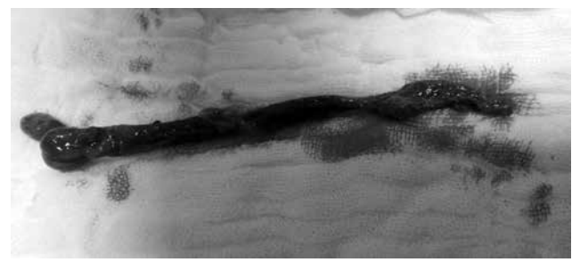
Figure 3. Image of the thrombus removed from inferior vena cava.

extracorporeal circulation, a remifentanil infusion with rocuronium bromide and midazolam was used.