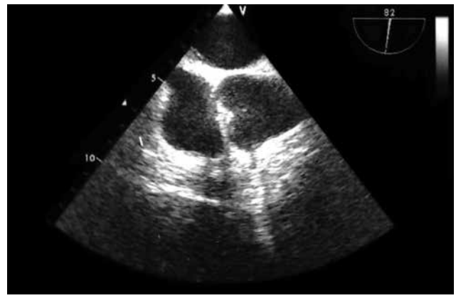
Figure 4. Intraoperative transesophageal echocardiography showing no residual thrombi after thrombus removal from the right atrium.

Throughout the operation, the patient was administered eight red blood cell suspensions and six units of fresh frozen plasma. Through inotropic support (dopamine 10 \mu g/kg/min) and arterial blood pressure, 95/40 mmHg, the heart rate was 110 bpm. In this tachycardiac state, the patient was transferred to the intensive care unit. The inotropic support and controlled mechanical ventilation were continued in the intensive care unit. The patient's alertness was evaluated 12 h postoperatively. As the respiratory effort was insufficient, mechanical ventilation was continued