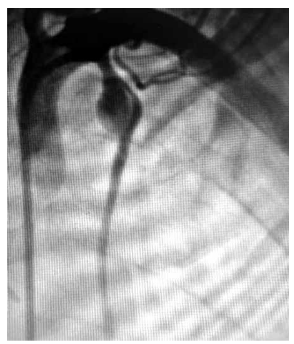
Figure 2. A pre-interventional catheter angiographic view of false aneurysm of left internal mammary artery.

False aneurysms or pseudoaneurysms are the leakage of the arterial blood from an artery into the