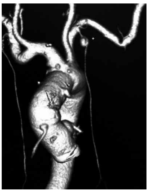
Figure 1. A pre-interventional multi-slice computed tomography angiographic view of false aneurysm of left internal mammary artery.

(CTA) after six years from surgery. Multi-slice CTA revealed a FA formation of the left IMA measuring a 10-mm diameter along with a 13-mm dilatation of the left main coronary artery button (Figure 1). The aorta was normal. Endovascular stent implantation for the treatment of FA of the left IMA and following the patient without any invasive intervention for the dilatation of the left main coronary artery button were decided. A written informed consent was obtained from the patient.