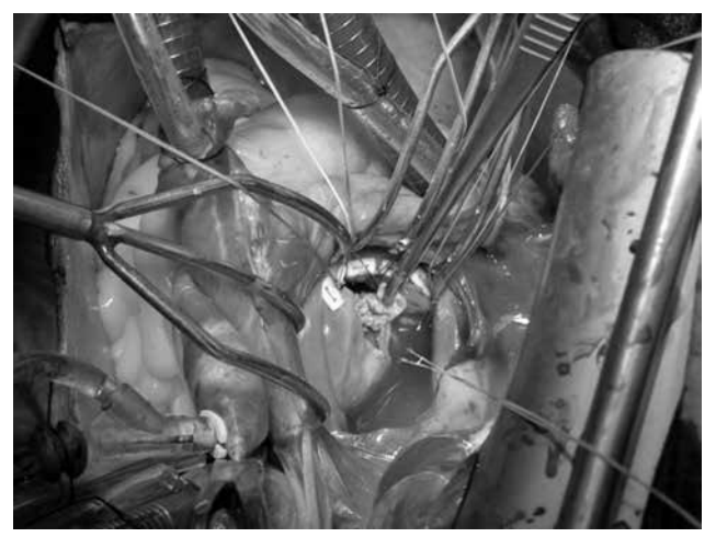
Figure 2. An intraoperative view of cysts drainage located at posterior mitral leaflet.

Although indirect hemagglutination test was positive, other blood tests including serology and complete blood count were normal. Abdominal ultrasonography revealed no other organ system involvement. A written informed consent was obtained from the patient. Preoperative coronary angiography showed significant stenosis on the left anterior descending artery (LAD). The patient was operated under cardiopulmonary bypass (CPB). Three yellowish intramyocardial cysts adjacent to the PML were dissected, caseification necrosis was drained and flushed with saline. Calcified germinative membranes were removed. Specimens