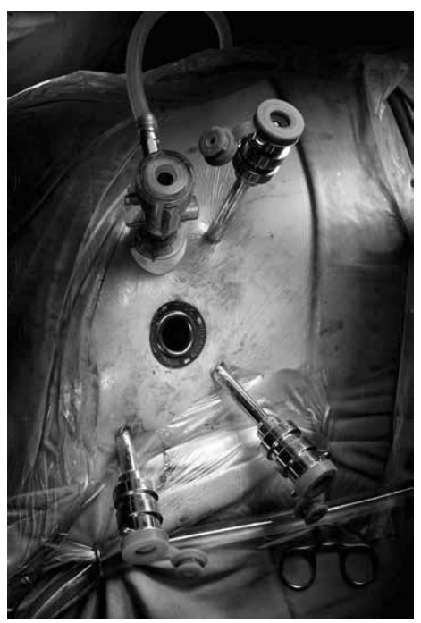
Figure 1. An intraoperative view of set-up for robotic-assisted mitral valve procedure.