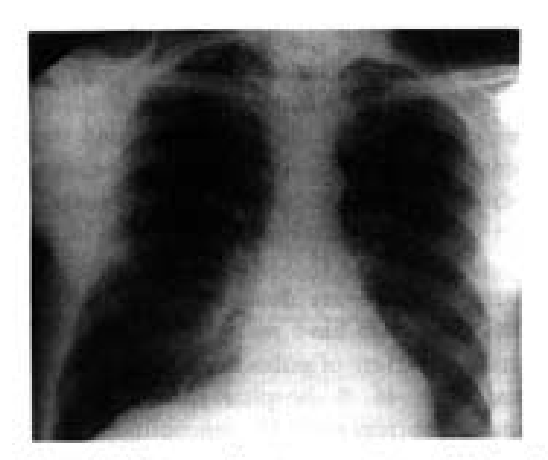
Figure 3. Chest x-ray showing a opacity in right lower lobe (Case 2).

interlobar glands. This patient was discharged home on the 7<sup>th</sup> postoperative day without complication. He was totally asymptomatic with no evidence or tumour recurrence 12 months after the operation.