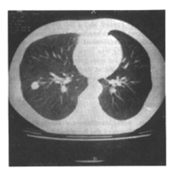
Figure 4. CT scan of the chest which shows a well-defined 1.5 cm nodule in the right lower lobe (Case 2).

Case report 2: A sixty-five year old male presented with moderately severe exertional angina pectoris. Coronary angiography showed triple vessel coronary artery disease and he was