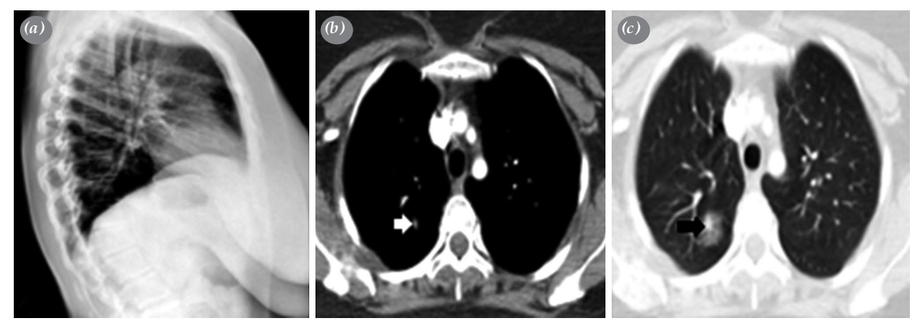
Figure 1. (a) Chest radiography showing nodular opacity in right upper lobe, (b, c) A 2×2-cm solitary ground-glass nodule located in posterior segment of right upper lobe on computed tomography.

lobe was decided. A written informed consent was obtained from the patient.