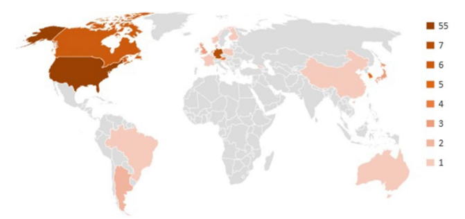
Figure 3. World map of top 100 most-cited articles.