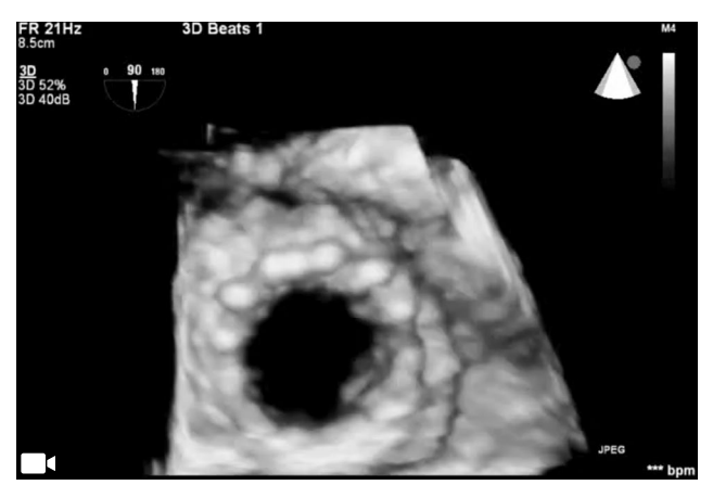
Video 5. Three-dimensional transesophageal echocardiography showing normal valve functions of Edwards Sapien XT® after the procedure.