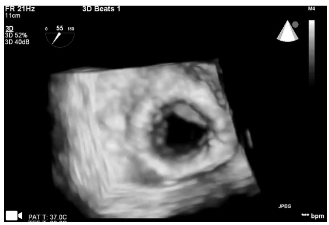
Video 2. Three-dimensional transesophageal echocardiography showing one of the bioprosthetic valve leaflet not moving.