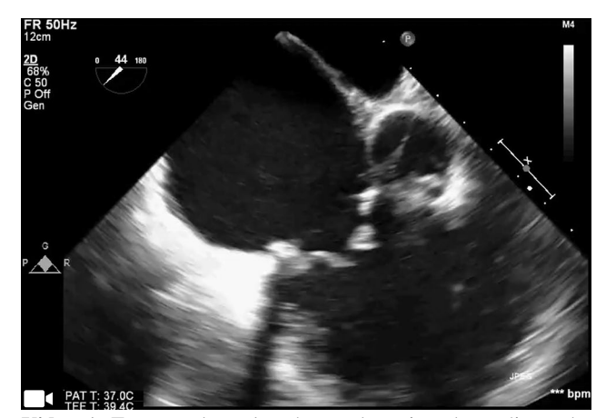
Video 1. Transesophageal and transthoracic echocardiography prior to intervention showing one of the bioprosthetic valve leaflets not moving and other leaflets thickened. Severe prosthetic valve insufficiency and moderate prosthetic valve stenosis.

In conclusion, transcatheter valve implantation into the bioprosthesis at the tricuspid valve position is an effective method for reducing the number of repetitive surgical interventions.<sup>[1-3]</sup>