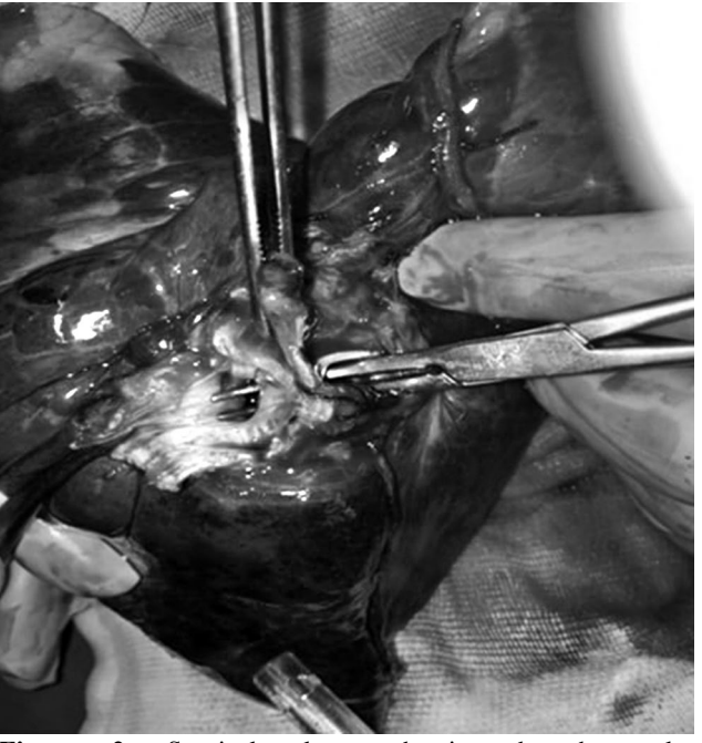
Figure 2. Surgical clamp showing bronchovascular communications at surgical specimen.