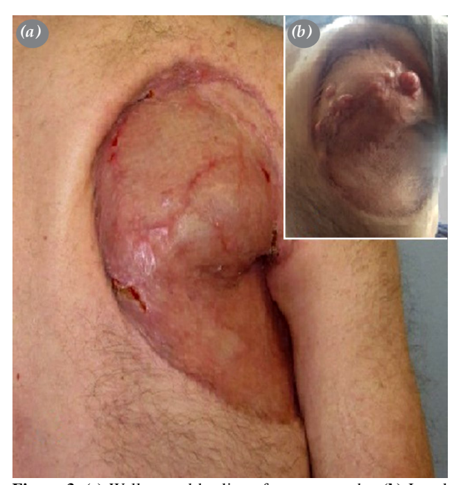
Figure 3. (a) Well wound healing after two months. (b) Local recurrence after six months.

At this stage, the patient was prepared for mass excision and repair of the defect with a meshed splitthickness skin graft (STSG) at a 1:1.5 ratio under general anesthesia. Complete blood count, complete biochemistry, coagulation parameters, and viral marker tests were within normal limits. The operation was initiated by giving the patient a left lateral decubitus position. Leaving 3 cm of healthy skin margin from the erythematous borders of the mass, the mass was resected from the dorsal surface of scapula and from the anterior fascia of the serratus anterior muscle with some fibers of the latissimus dorsi muscle and also with the affected skin in an en bloc fashion. Tumor weight was 2.132 g and the long diameter of the tumor was 20 cm (Figure 1d, e). The STSG taken from the right anterolateral thigh was first meshed at a ratio of 1:1.5 and, then, adapted to the defect (Figure 1f, g). The operation was completed with appropriate bolster dressing. Gross examination showed a circumscribed light tan and firm mass which had fibrous capsule