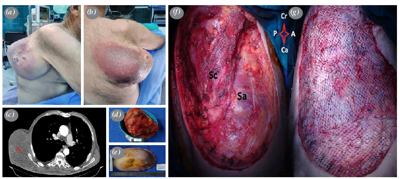
Figure 1. (a) Anterior view of the mass extending through the axilla. (b) Posterior view of the mass. (c) Axial thoracic computed tomography image of the mass. (d) Resection specimen with a tiny fibrous capsule weighing over 2 kg. (e) Resection specimen with a skin margin of 3 cm. (f) Chest wall after resection of the mass. (g) Chest wall meshed with split-thickness skin graft. m: Mass; Sc: Scapula; Sa: Serratus anterior muscle; Cr: Cranial; Ca: Caudal; A: Anterior; P: Posterior.