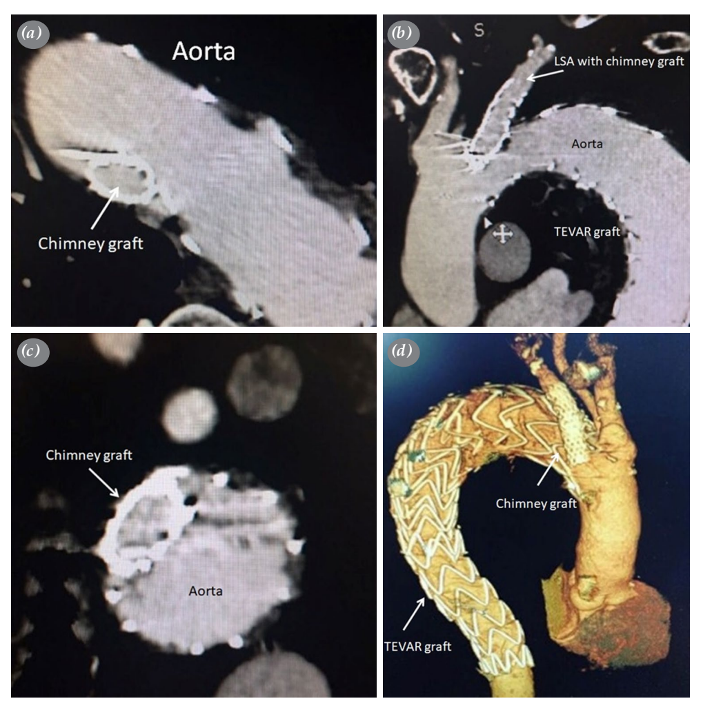
Figure 1. Multiplanar sections of the TEVAR graft in thoracic aorta and chimney graft in left subclavian artery (arrows); (a) coronal; (b) sagittal; (c) axial; (d) three-dimensional image. TEVAR: Thoracic endovascular aortic repair.

used along with the chimney stent. Systemic arterial blood pressure was maintained below 80 mmHg during aortic stent graft implantation. An oral dose of clopidogrel 300 mg was administered to all of the patients postoperatively. The patients were discharged on the postoperative second day with a prescription for oral clopidogrel 75 mg a day for a month and oral acetylsalicylic acid 300 mg a day indefinitely. All patients were followed at one, three, six months and one year with CTA.