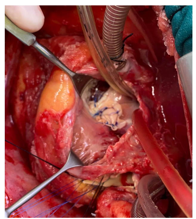
Figure 1. Necrotic materials around the Gerbode defect and aortic valve were completely debrided. The Gerbode-type defect was closed by using bovine pericardium with bovine pericardium pledgeted sutures.