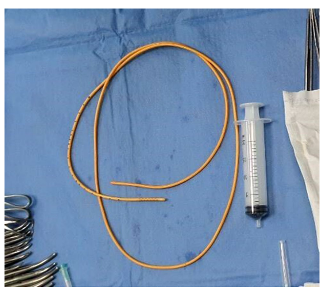
Figure 4. Antibiotic-impregnated peritoneal distal catheter-closed type.

The silicone tube replaces the sclerosed lymphatic