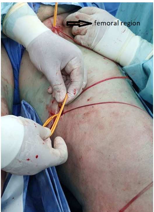
Figure 5. Insertion of silicone tubes in the subcutaneous tunnels.