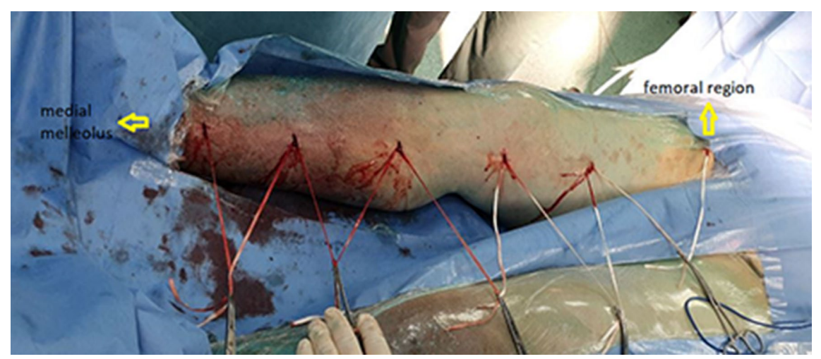
Figure 3. Skin incisions and created tunnel in the subcutaneous tissue.

of the ankle, a 1-cm incision was made on the medial side of the leg at approximately 15-cm spaces, and a tunnel was created in the subcutaneous tissue to the femoral triangle (Figure 3). A second tunnel was established with the same technique in a posteromedial line parallel to the previous tunnel and two tunnels were connected in the femoral triangle in the region of inguinal lymph nodes. Subsequently, two pieces of antibiotic-impregnated peritoneal distal catheters-closed type (Desu Medical, Ankara, Türkiye) (Figure 4) of 1.3-mm outer diameter and 1.1-mm inner diameter were washed with 2,500 IU heparin and inserted into the tunnels for both lower extremities (Figure 5).