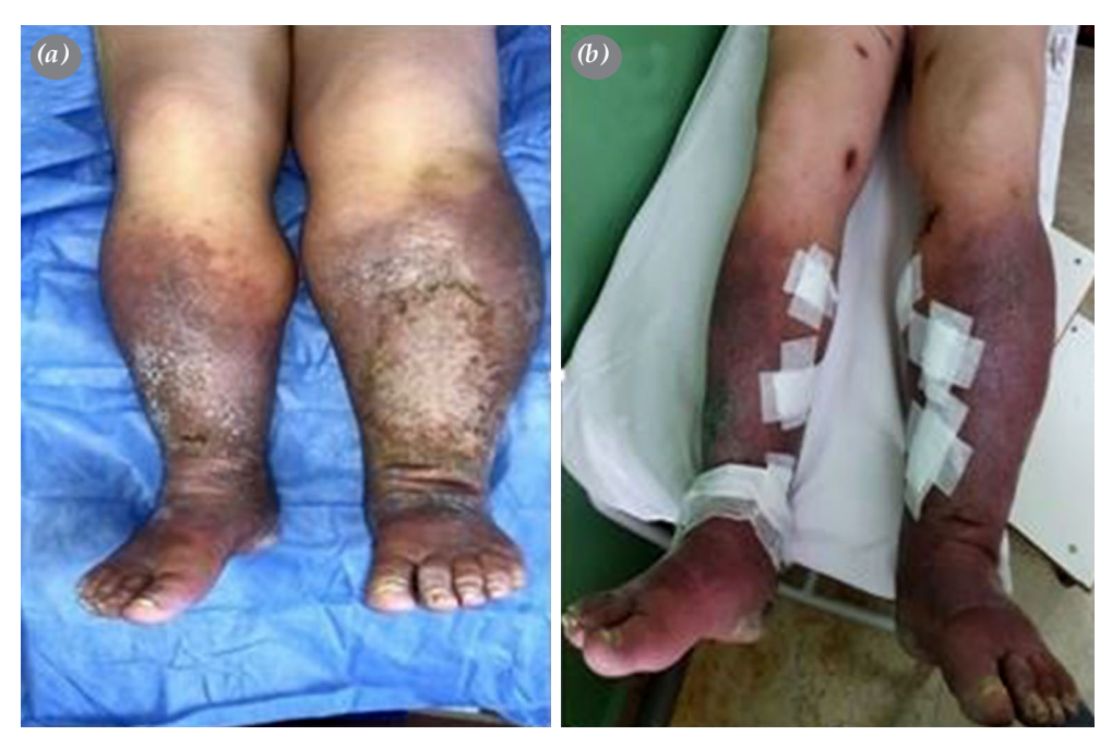
Figure 1. (a) Before the operation. Stage 3 lower extremity lymphedema according to LEL index. (b) Two weeks after operation (Stage 1 right lower extremity and Stage 2 left lower extremity as LEL index, chronic atrophic changes in the skin without infection and severely reduced edema are seen).

extremity. In his medical history, he had hypertension, but no diabetes mellitus, and had exposed intermittent subcutaneous tissue infection six years ago. On his physical examination, there was widespread edema, skin infection, and Stage 3 lymphedema below the knee, but was Stage 2 lymphedema above the knee in the bilateral lower extremities (Figure 1a). No arterial or venous pathology was detected on Doppler ultrasonography. Due to the skin and subcutaneous infection, ciprofloxacin 500 mg and wound care treatment (mixed wound care products which include burrows solution 30 g, zinc oxide 60 g, and lanolin 90 g) was administered in advance the surgical treatment for one month. Multilayer tight compression bandaging was applied in addition to wound care treatment until the operation. The LEL indices were used for the volumetric assessment of the affected extremity with severe edema. The LEL index and calculation of the formula are calculated by taking the sum of the squares of the circumference in five areas of a lower extremity and dividing it by body mass index (Figure 2).[3] The LEL index was of the right lower extremity was 303.5 and of the left one was 335.3. According to this measurement, bilateral LEL indices were Stage 3.