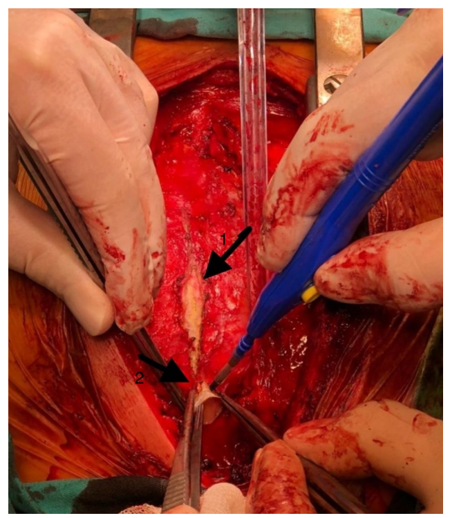
Figure 2. An intraoperative view showing the right ventricle (first arrow) and freeing aorta (second arrow).

Following pericardiectomy, the patient had an uneventful postoperative period with symptomatic relief and was discharged on Day 5.