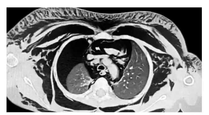
Figure 2. Traumatic pneumothorax and pneumomediastinum.

Another type of pneumothorax is acquired pneumothorax. Thoracic traumas are divided into penetrating and blunt traumas. Posttraumatic pneumothorax can develop due to damage to the chest wall, lungs, tracheobronchial tree, and esophagus.