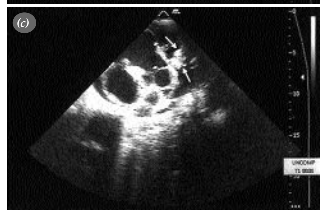
Fig. 1. (a) Ventricular septal defect from the parasternal long axis view. (b) Vegetation under the posterior leaflet of the tricuspid valve from the apical window. (c) Vegetations involving the pulmonary artery from the parasternal short axis.

tion and was discharged from the hospital on his own will.