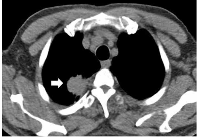
Figure 1. A contrast computed tomography image showing the lesion in the right upper lobe of the thorax (arrow).

was observed with an ejection fraction of 50%. Cardiac catheterization demonstrated 95% stenosis of the left anterior descending (LAD) coronary artery, while other coronary arteries did not have any occlusion higher than 30% (Figure 2).